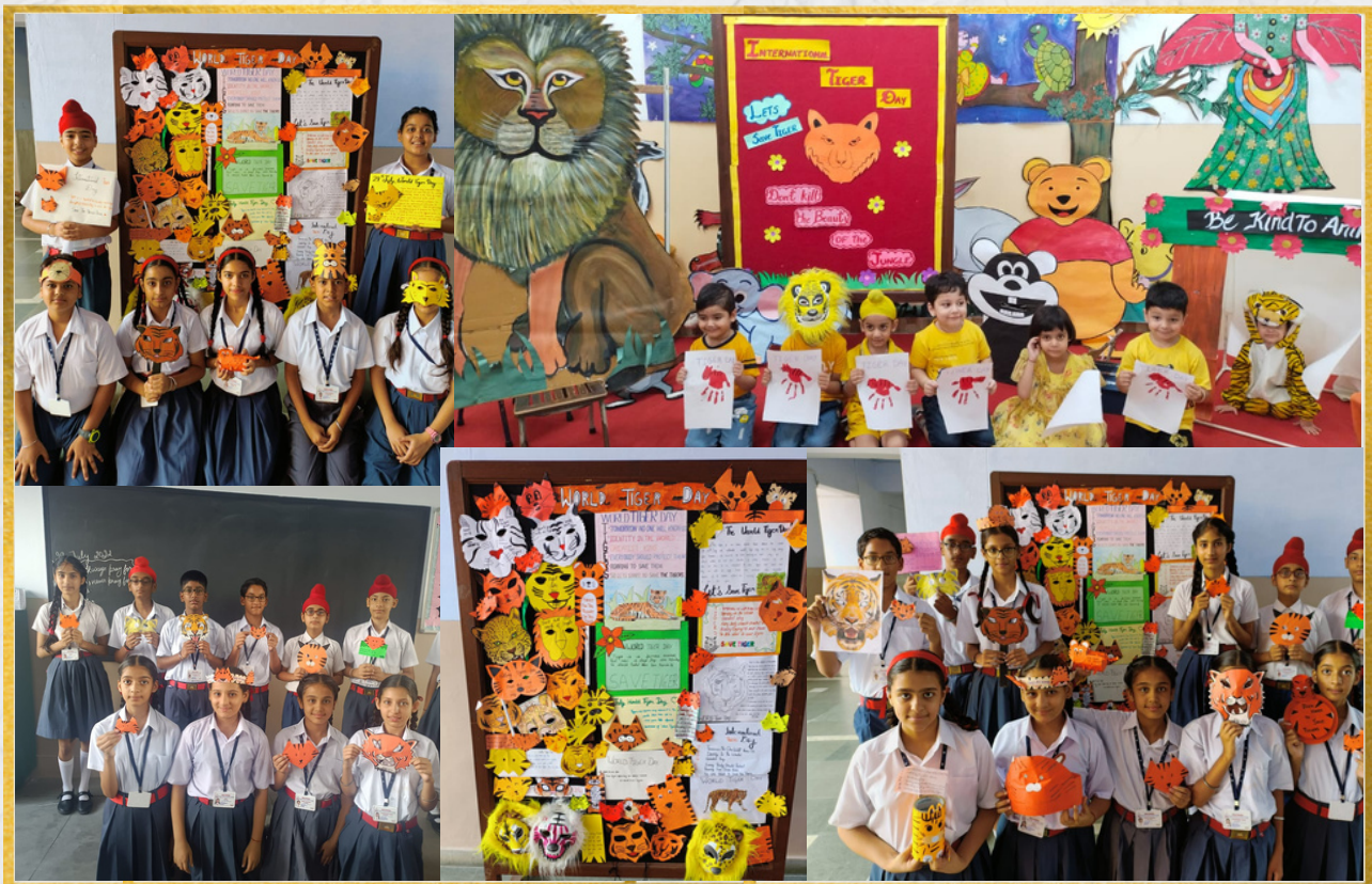
Let's balance our ecosystem by bringing tigers back from the brink of extinction